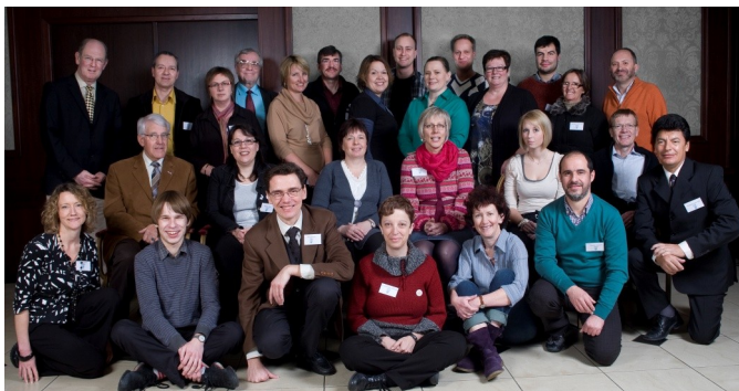
Photo: FIN 2011 membership meeting attendees